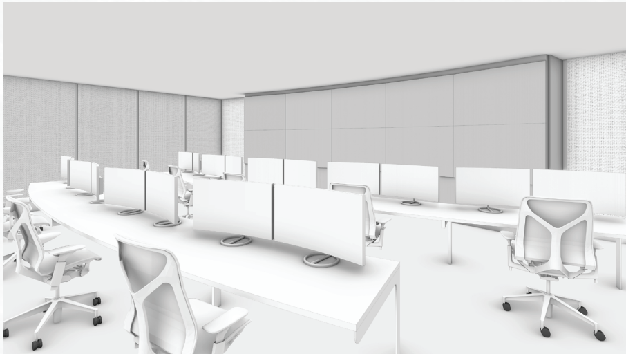
Internal control room