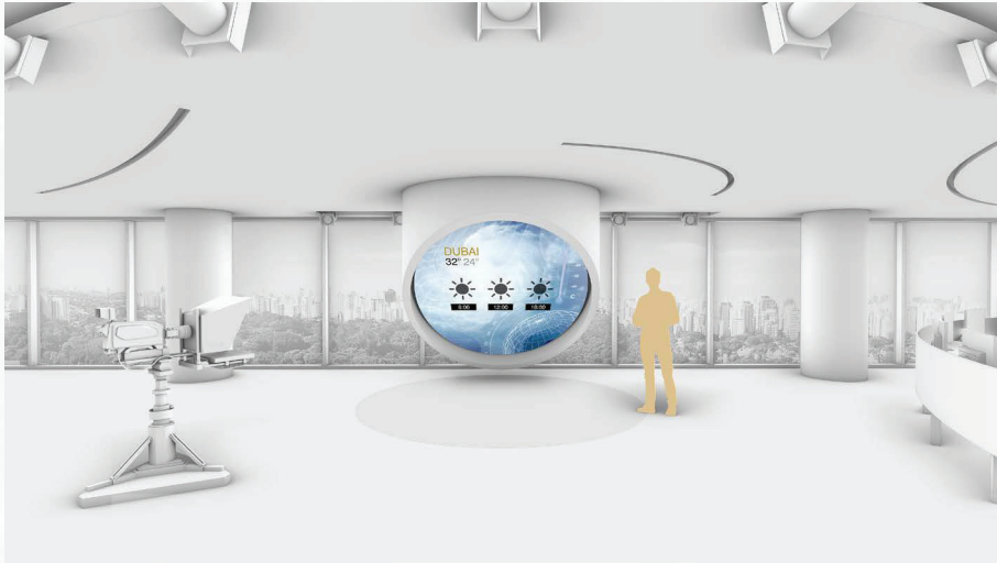
Weather forecast display