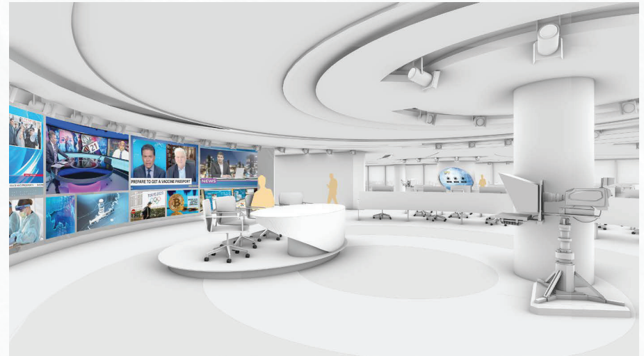
Primary broadcast desk