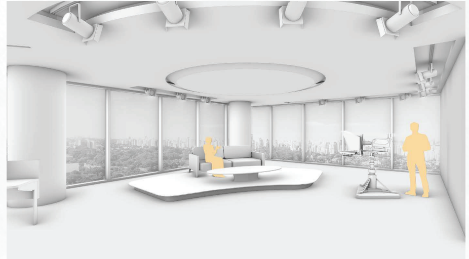
Secondary broadcast setup